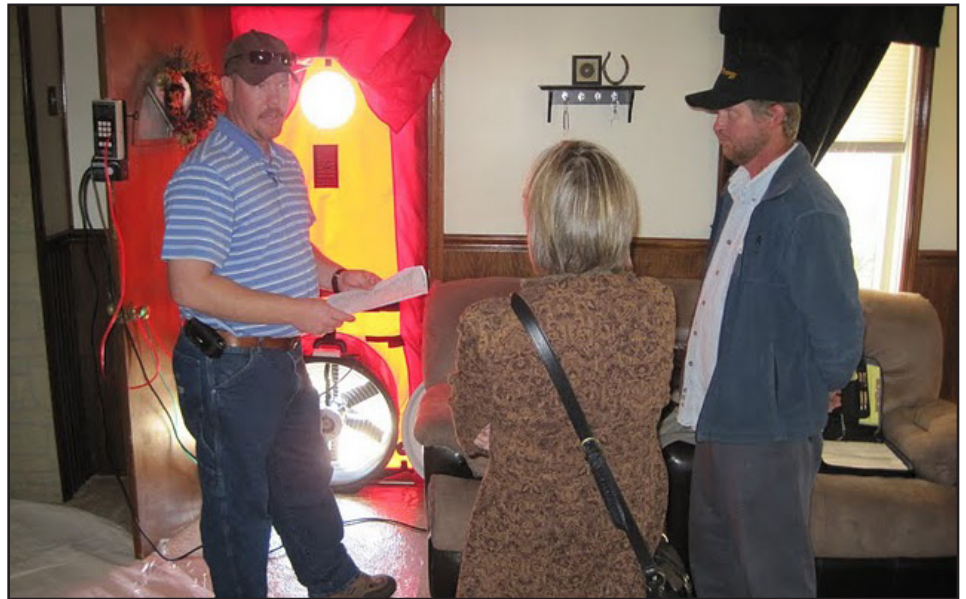
A weatherization crew member demonstrates a blower door test to visitors at a weatherization demonstration in Murray City. The test is used to measure air leakage in homes before and after weatherization.