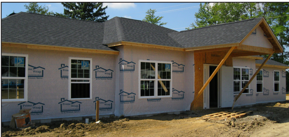
Blanchester Senior Villas in Clinton County will inject approximately $5 million into the local economy while providing much needed senior housing. Clinton County Community Action reports there is already a waiting list for the 40 units.

Construction is being overseen by Ohio contractor LW Associates which plans to contract with between 25 to 30 subcontractors, each of which will employ 5 to 15 craftsmen. A total of 270 jobs will be created by the project as well as a boost to local restaurants and other businesses.