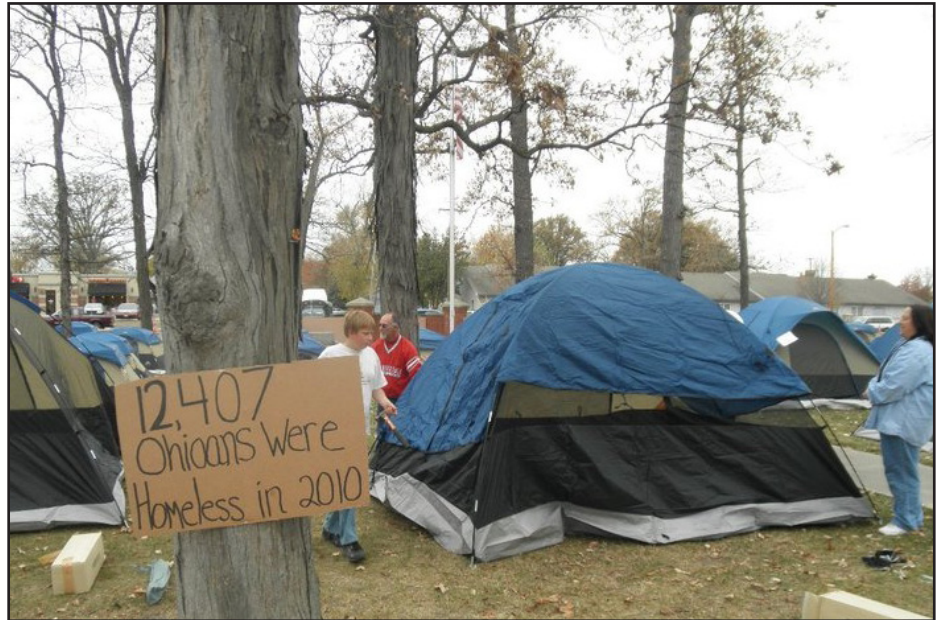
Participants set up tent city on the campus of Defiance College in preparation for Northwest Ohio Community Action Commissions' fourth "Night Without A Home." The 98 tents represent the 98 families The PATH Center served in 2009.